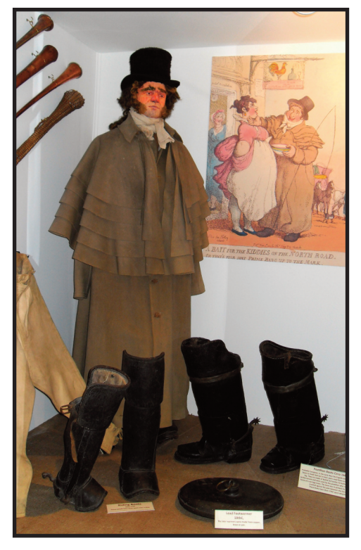
A corner of the clothing department

There is a clothing department with hats and coats that can be tried on.