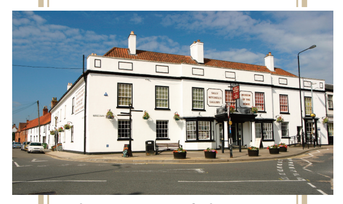
The Museum Of The Horse Tuxford NG22 0LA