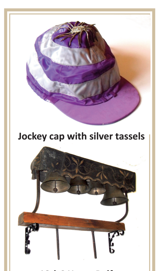
18thC Horse Belfry

There is also a coffee shop on the premises and an art gallery and gift shop.